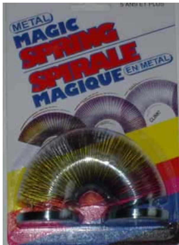
Magic Spring Spirale