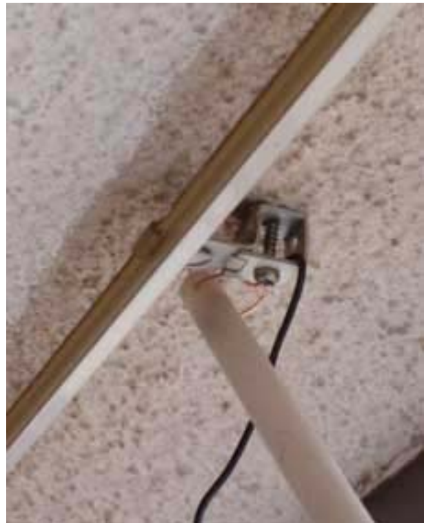
Antenna hung up to eave

Antenna Adjustment at 20 meters Band: Above all, stay your K-1 to 2W. Antenna (spiral at first it is not spreading by the stick) is connected to K1 by a small (50- 70 cm) length of a coax. A small bulb is connected in serial with the spiral. I have used a bulb from a toy gun feeding from 3V. Turn on K1 to receiving mode to the 20 meters. With help of a dielectric stick (I used a length of a plastic water pipe) in 1 meter length lift upwards the spiral. Find off the spiral length when you have the best reception. Do a hole in the stick at the length and pass through the hole the end of the spiral. After that once again with the help of the dielectric stick, approximately on the length of 2/3 (from spiral length) from the antenna bottom, lift or lower coils by the best reception. Coils are fastened by Scotch at the proper place. After that you may turn on K1 to transmitting mode (for a short time) and to make final adjustment of the spiral (by max glow of the bulb) at the length of 1/3 (from spiral length) from the bottom. Coils are fastened by Scotch at the proper place.