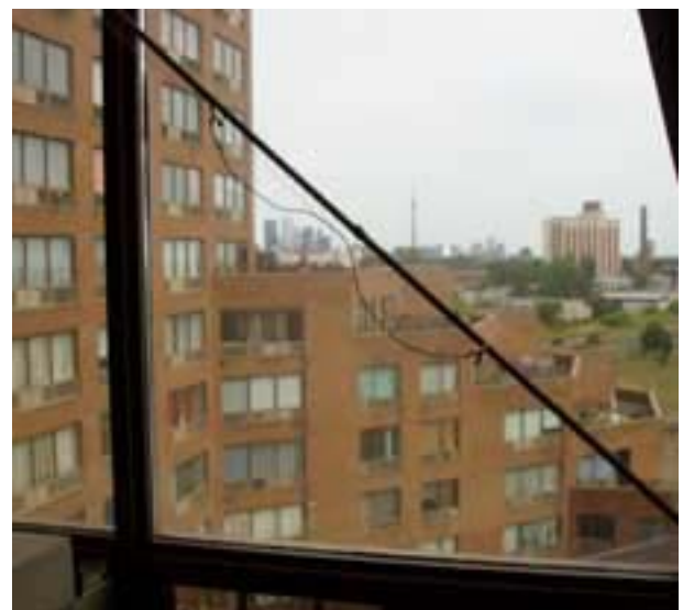
Helical Antenna for 17 meters