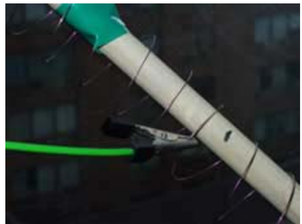
Bridge for The 17 meters

Practical Measurement Parameters of the Helical Antenna: I used a home made RF bridge (see Reference 2) for metering of the helical. My Helical has input impedance 35 Ohms at the 20 meters and 46 Ohms at the 17 meters.