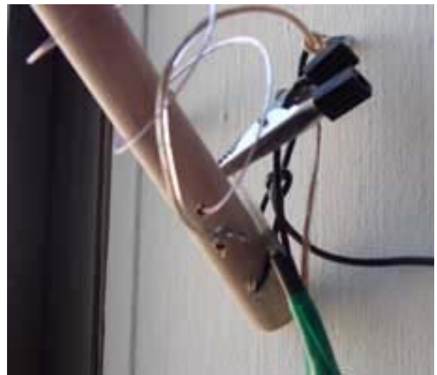
Fastened the Spiral to the Form

Antenna Adjustment at 17 meters Band: Prepare a 60 cm length insulated wire (18 AWG) with crocodile clips at the both ends. Connect to K1 the antenna and turn on it to RX. Short different parts of the spiral by the best reception.