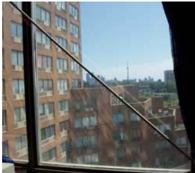
Helical Antenna at the Window

Design of the Helical Antenna: Photo shows the helical at the window. At first three holes were drilled (one at up and two down) in the stick. Copper wire in diameter of 18 AWG and 15 cm in length was attached to the stick through the holes. Helical antenna was hung up with the help of the wire to an eave. Down part of the antenna was fastened by the wire to a hook. Spiral wire was gone through another hole. Antenna ground was connected to aluminum window frame. My window frame was connected (it was prove by measurement) to the main "ground" (green wire in the main).