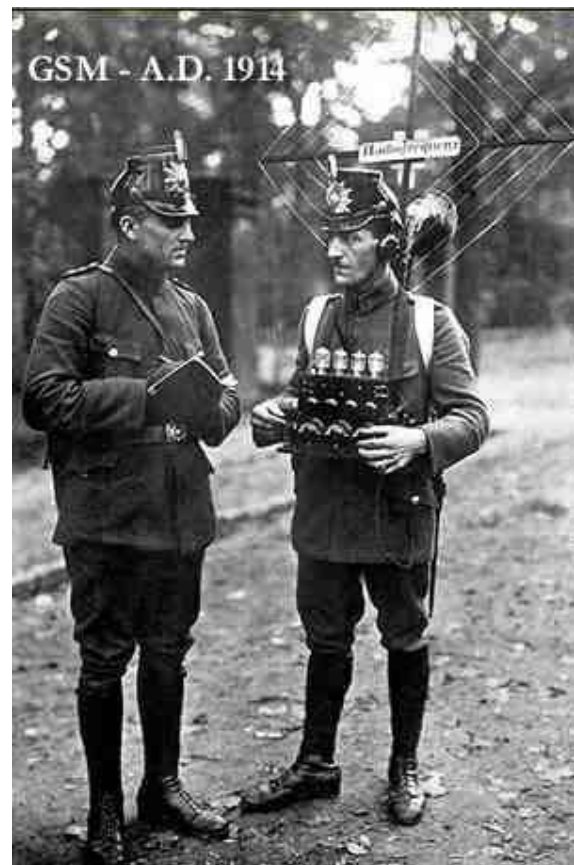
May be the first receiver for DX?