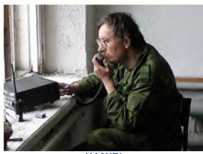
UA9XBI Radio club 'Arktika' Championship 2004

However, input resistance of a PA containing 2 tubes GU50 (that is close to 50- Ohm at major amateur HF-ranges) is differed from input resistance of a PA with 3 tubes GU50 (the resistance lower in 1.5 times compare to 2xGU50- sample), and of course differ from input resistance of 4xGU50- PA (the resistance lower in 2 times compare to 2xGU50- sample). So, the input resistance for those PAs with 3 and 4 tubes is differ the 50-Ohm that requires proper matching of the PA with driving transceiver.