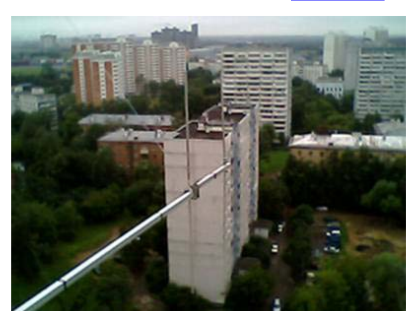
Two-Elements YAGI for 145-MHz: Balcony Project

Well, why I did a Two- Elements YAGI? Why not Three, Four or more Elements YAGI? Or, say, so popular 2-5/8 or 3-5/8 Vertical Collinear Antenna?