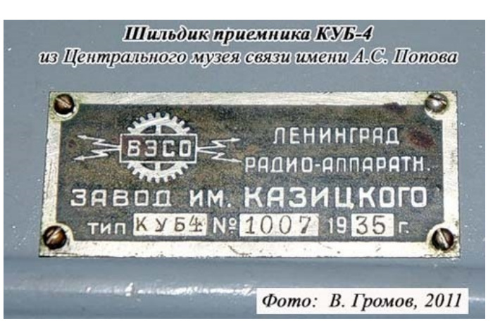
Figure 3 Label of the KUB- 4