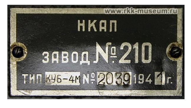
Figure 6 Label of the KUB- 4M