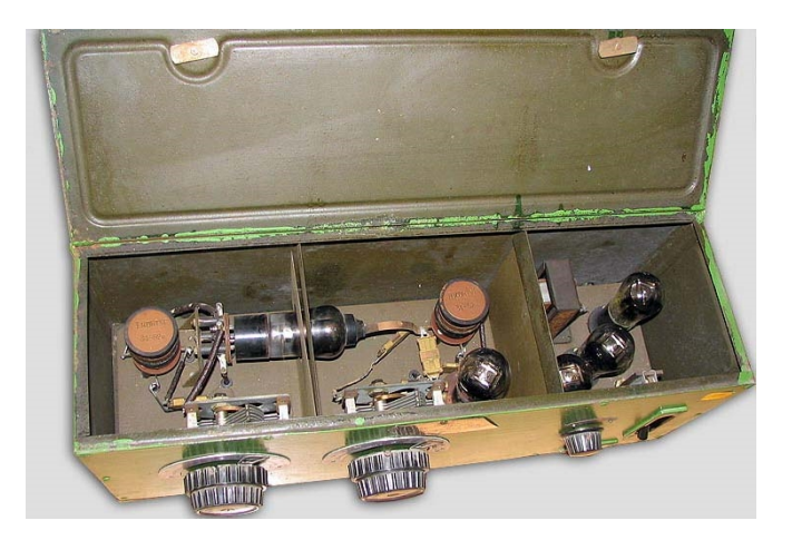
Figure 1A Receiver KUB- 4 Inside View