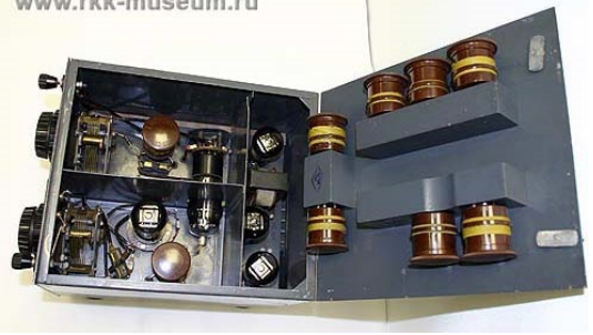
Figure 5A KUB- 4M Inner View

It is still possible to find the KUB- 4 and KUB-4M at the ham hands. However, time is going, and the legendary receiver is going to the past.