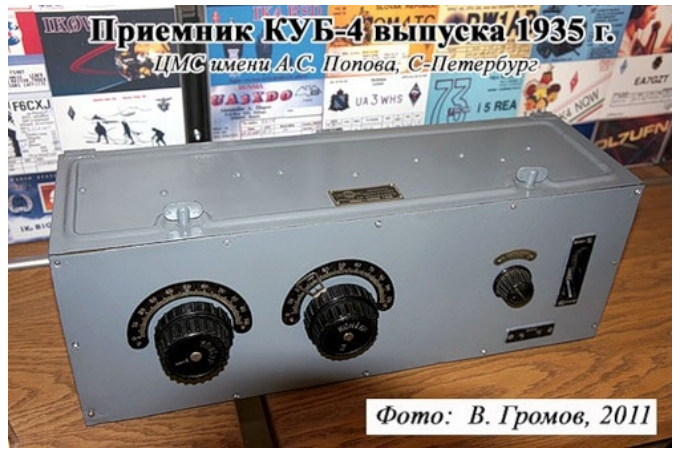
Figure 1A Receiver KUB- 4 Front View

The receiver KUB- 4 was produced since 1930 till 1942 in the Leningrad, at the Kozitsky Radio Plant. Figure 3 shows a Label of the receiver KUB- 4. The receiver had five bands that could cover the frequencies 1.5...30.0- MHz (some receivers had the upper band a little lover or a little higher the 30.0-MHz). The needed band was chosen with the help of plug- in inductors. Unused inductors were placed in a separate box or fixed to the upper cover inside of the receiver. Such design had the own advantages and disadvantages... The receiver KUB-4 had weight 8.0-kg and dimensions 500 x 143 x 180- mm. Power battery with +120- V for plate, +40- V for the second grid, + 4-V for heater and -2- V for the first grid was required for the receiver.