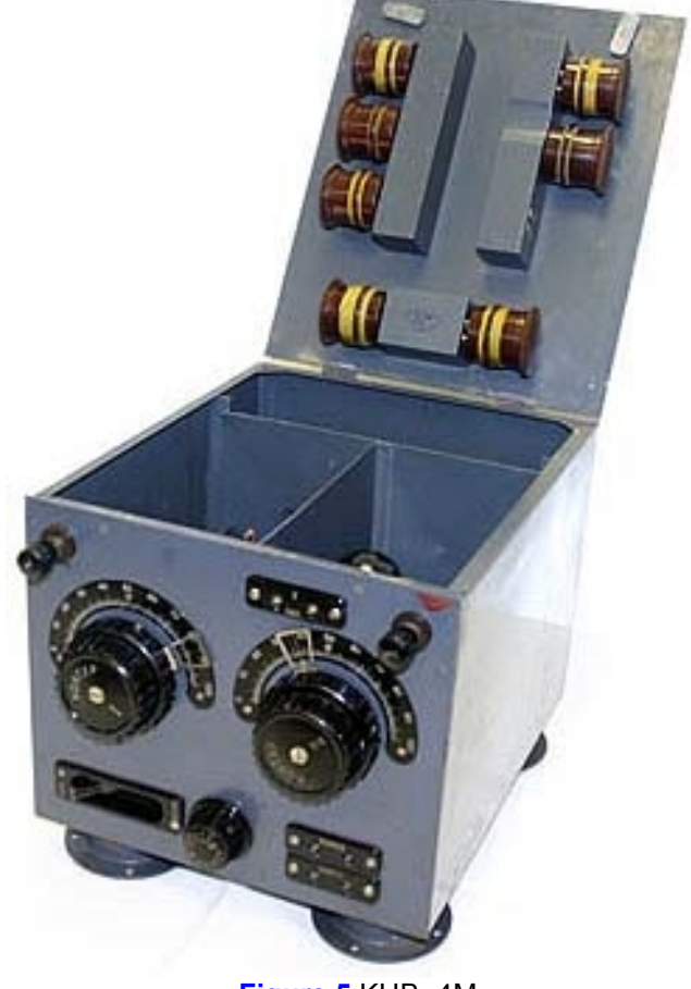
Figure 5 KUB- 4M Front View

Info and Pictures were taken from the references (all in Russian):