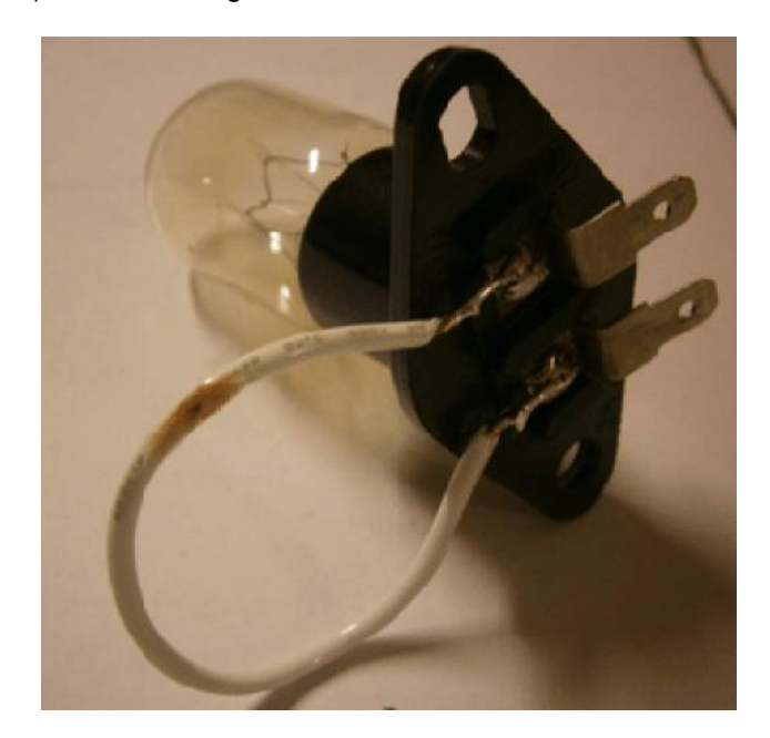
Figure 3 20W Probe (B)

The probe bulb is flashing very brightly according to Oven's magnetron pulse radiation. I experimented with filament bulb for 120V/40W, 120V/60W and 120V/100W. All bulbs flashing enough brightly in depend of a load (water, meals, etc) that was being inside of the Oven.