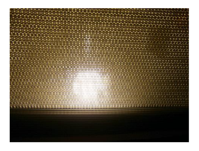
Figure5 Blowing a CFL Lamp inside a Microwave Oven