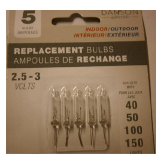
Figure 1 Kit for repair Christmas-tree light decorates

Next subject for experiment was a 120V/20W filament bulb. It was lamp from an old microwave. Bare lamp did not flashing in the microwave Oven.Then I added to the lamp leads a loop in perimeter 12 centimeters. The loop was a loop antenna that tuned to 2.45- GHz. The lamp was a load for the antenna. Just remind, that oven's magnetron works at the 2.45- GHz. Figure 3 shows design of the probe. I put the probe inside of the Microwave Oven with some meals and turn on the oven.