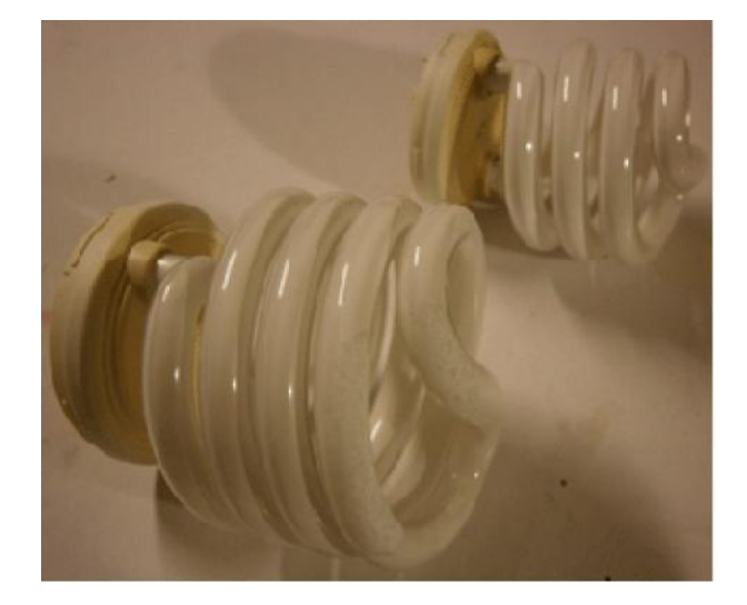
Figure 4 CFL Lamps