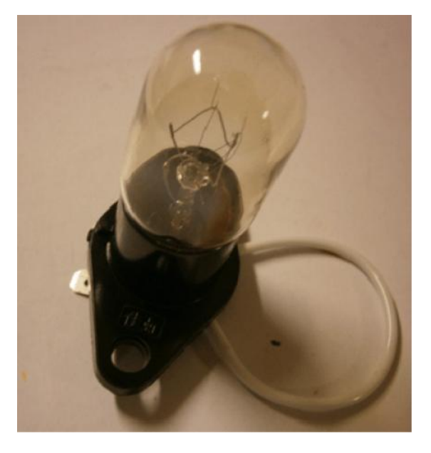
Figure 3 20W Probe (A)