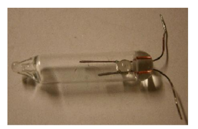
Figure 2 Bulb from the kit for repair Christmas-tree light decorates

I bought at nearest Walmart a kit of bulbs for repair of my Christmas-tree light decorates. Figure 1 shows the kit. The kit contains 5 bulbs for 2.5- 3.0- V. Figure 2 shows the bulb from the kit. For me it was interesting the behavior of the bulb in my Microwave Oven. I put the lamp in the oven with some meals and turn on the oven. The bulb is flashing very brightly according to oven's magnetron pulse radiation. The lamp is flashing anywhere in the Oven- at the turning plate or being sealed at the Oven's door. Adding several centimeters of wire to the bulb leads may kill the bulb in the oven. Leads of the bulbs may be soldered together at the ends. It is not prevent the Lamp from flashing in the working microwave.