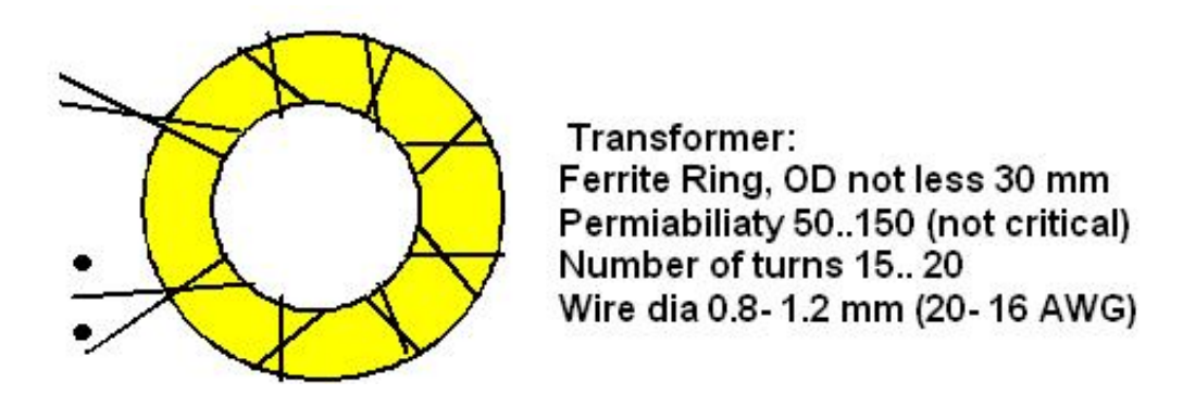
Figure 3 Design of the Balanced Transformer