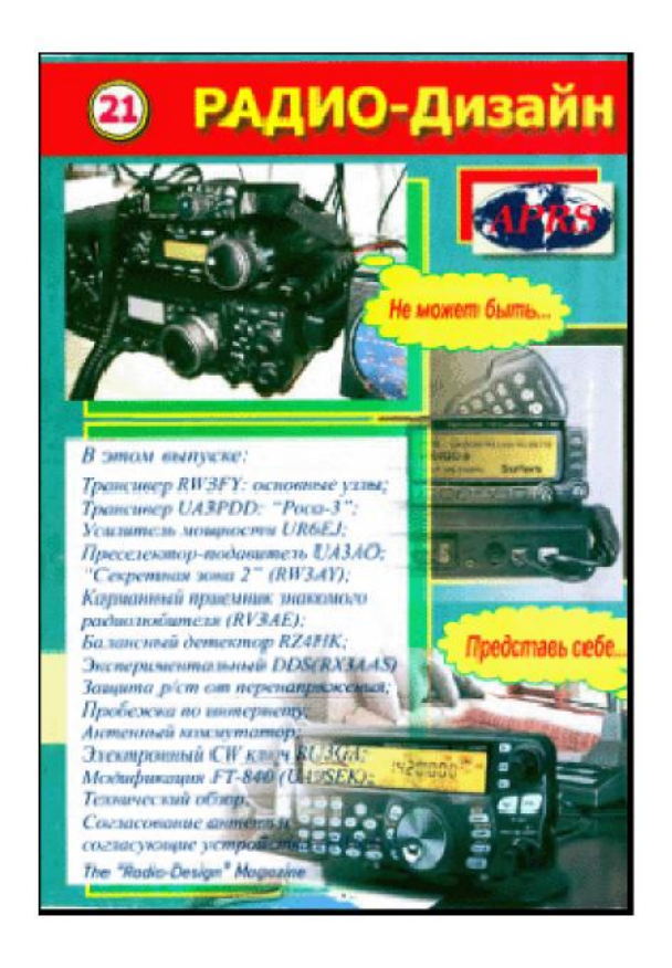
Front Cover Radio- Design # 21