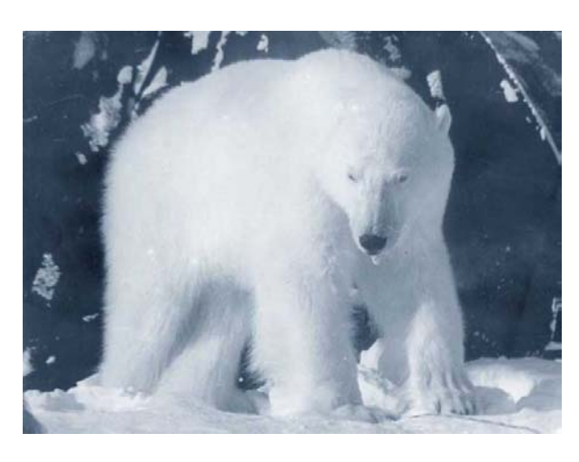
Do you faced with the effect?