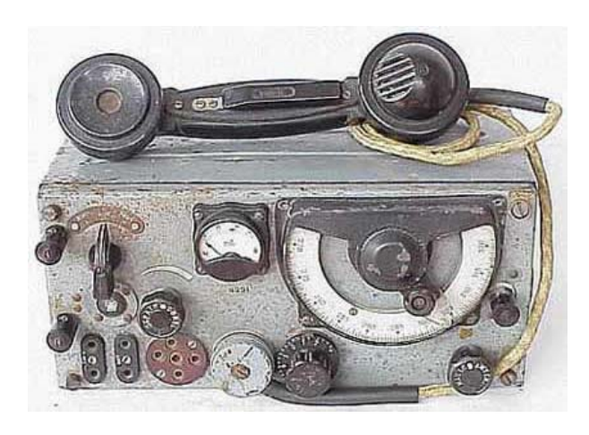
And very interesting message is on the next page. Go to the page!